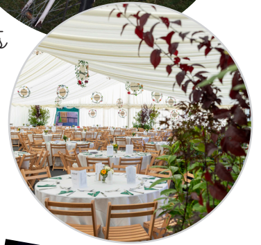
Plants to provide height and an instant summer feel.