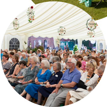
LED lighting for low-cost, high-impact atmosphere.